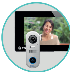
Powerful Video Entry