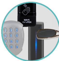
Innovative Access Control