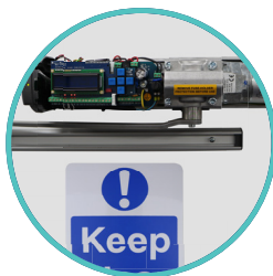
Universal Door Automation